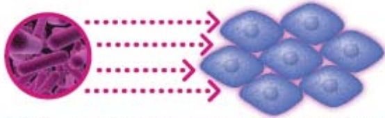
ENVIRONMENTAL STRESSORS ELICIT CELLULAR RESPONSE

Your body is designed to facilitate inter-cellular communication. This keeps all the parts working together. Much of this communication is in response to stressors, things like viruses, allergens, or pollution.